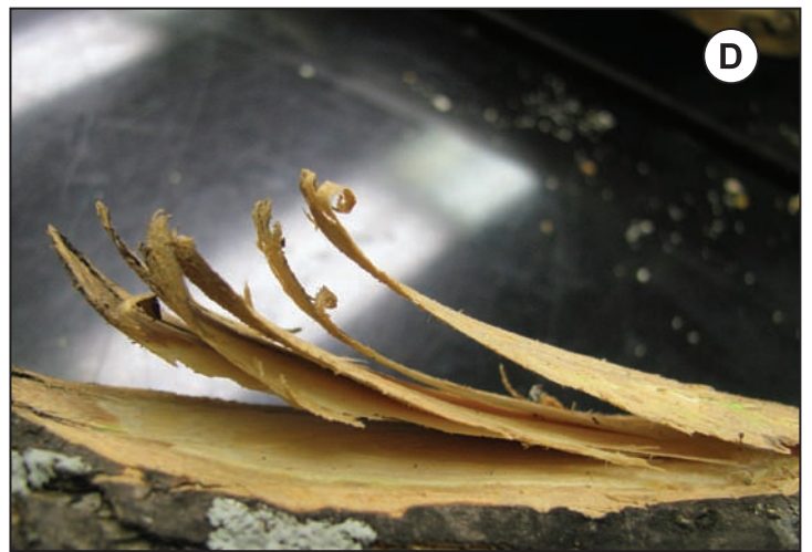
Fig. 4. Cutting (a), measuring and trimming (b) ash branches. Branches, cut to a length of 75 cm, are placed in a vise and bark is whittled off the basal 50 cm (c) (1.5 m piece shown here). Whittling removes bark in thin 1-2 mm strips (d).