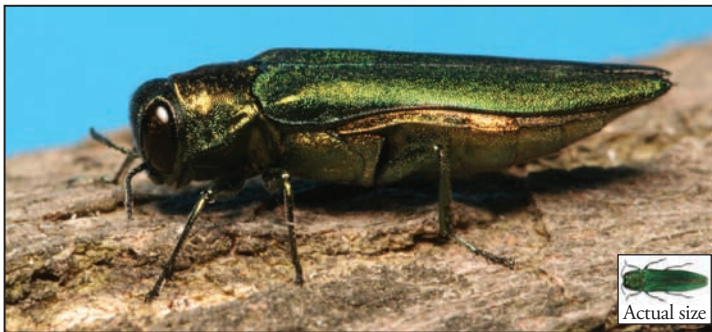
Fig. 1. Adult emerald ash borer

The emerald ash borer (EAB), Agrilus planipennis Fairmaire (Fig. 1), a non-native insect pest of Asian origin, presently infests large numbers of ash ( Fraxinus spp.) trees in Ontario and Québec and could soon spread to other provinces.