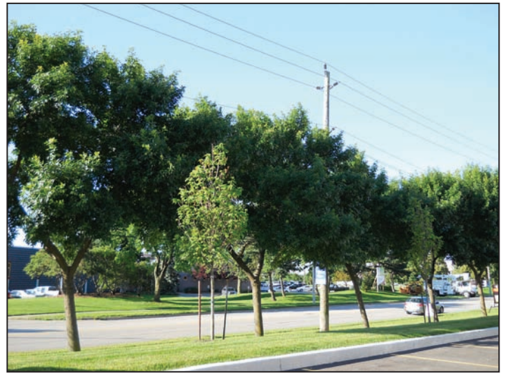
Fig. 2. Healthy-looking ash trees with no visible sign or symptom, but determined to be infested with EAB using branch sampling.

One of the many requirements for effective management of EAB is early detection of infestations, when densities are still low and before signs and symptoms are obvious. Visual surveys rely on external signs and symptoms (e.g., exit holes, larval tunnels seen through cracks in the bark, feeding by woodpeckers or squirrels) that may not be noticeable for 2 to 3 or more years after the arrival of the population, particularly if the infestation begins in the upper part of the tree. Sticky traps baited with an attractant have the potential to detect EAB adults in an area before signs or symptoms become visible, but may not necessarily provide information on the infestation status of individual trees.