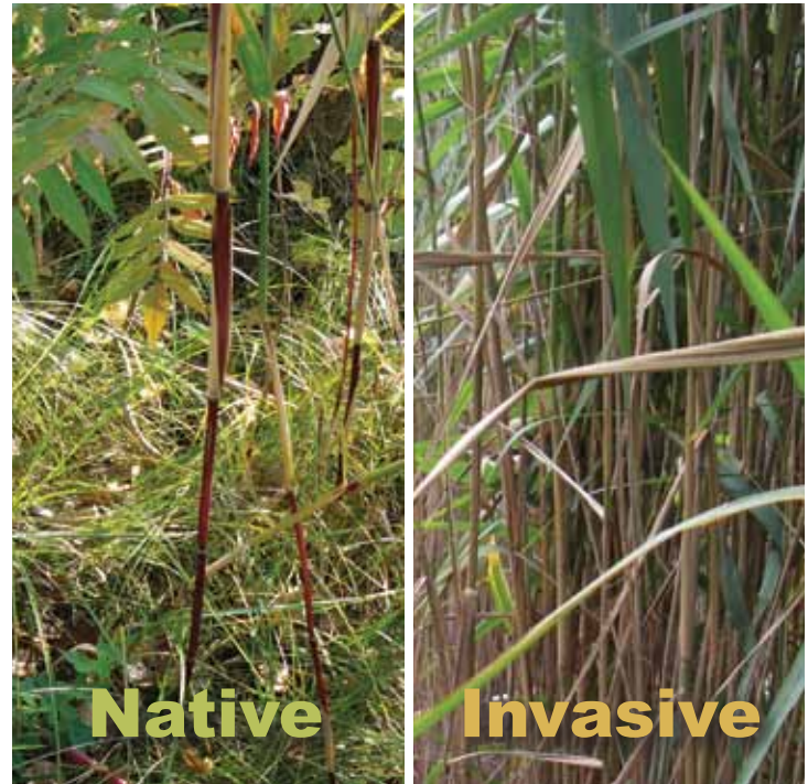
Figure 2: A native Phragmites stem (left) and an invasive Phragmites stem (right). Note the reddish brown native stem on the left, and the tan/beige invasive stem on the right.

Native stand photo courtesy of Erin Sanders, MNR. Invasive stand photo courtesy of Janice Gilbert, MNR.