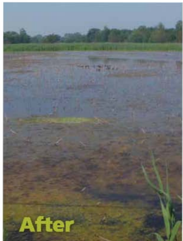
Figure 5: A study site at MacLean's Marsh, using 5% glyphosate. Before: Pre-treatment, 2007. After: Post-treatment, 2008. Note: There was no standing water in this area at the time of treatment.