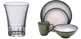
glassware, pottery & dishware