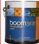
plastic paint cans