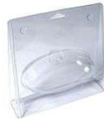
Moulded retail Packaging or non-medical blister pack (boxboard & paper removed)