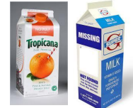
milk and juice cartons