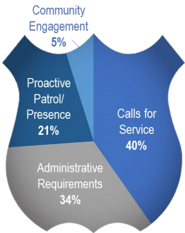
Figure 1: Service Delivery Model Provincial Target

In the short term, detachments may face challenges in achieving these targets. Continued improvements in scheduling tools, data integrity, and strategic deployment will support progress toward these goals.